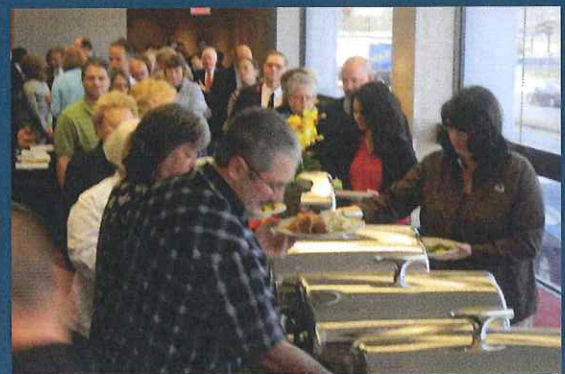
Thanks again to everyone in attendance! We appreciate you!